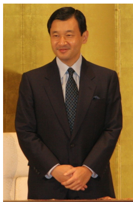
Imperial Highness the Crown Prince of Japan

His Imperial Highness the Crown Prince of Japan expressed his pleasure that the Second Annual Meeting was convening in Kyoto, with so many international participants. He noted that in the past two decades, the advancement of science and technology has exceeded all expectations, particularly in the field of life science, information and communication technology. His Imperial Highness pointed out how society has greatly benefited from these developments and how they