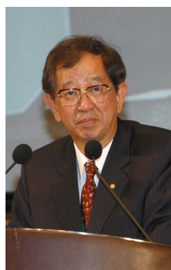
Yuan Tseh Lee

productivity are built. Government's role is to ensure that a healthy environment for innovation is in place including an adequate supply of highly trained people, a strong research base, and a competitive business sector. Without open-ended, curiosity-driven research to produce new ideas, new discoveries, and new technological advances, there is a risk of running the wellspring of innovation dry. Innovation is not just a source of growth for industrialized countries. It also presents the best opportunity for developing nations to escape from the grip of grinding poverty, disease, and despair. Education, science, technology, and innovation embedded in a sound, stable system of governance with good leadership are the keys to economic growth and advancement.