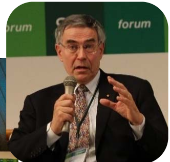
Mr. Rush D. Holt, Jr. of American Association for the Advancement of Sciences (AAAS), USA