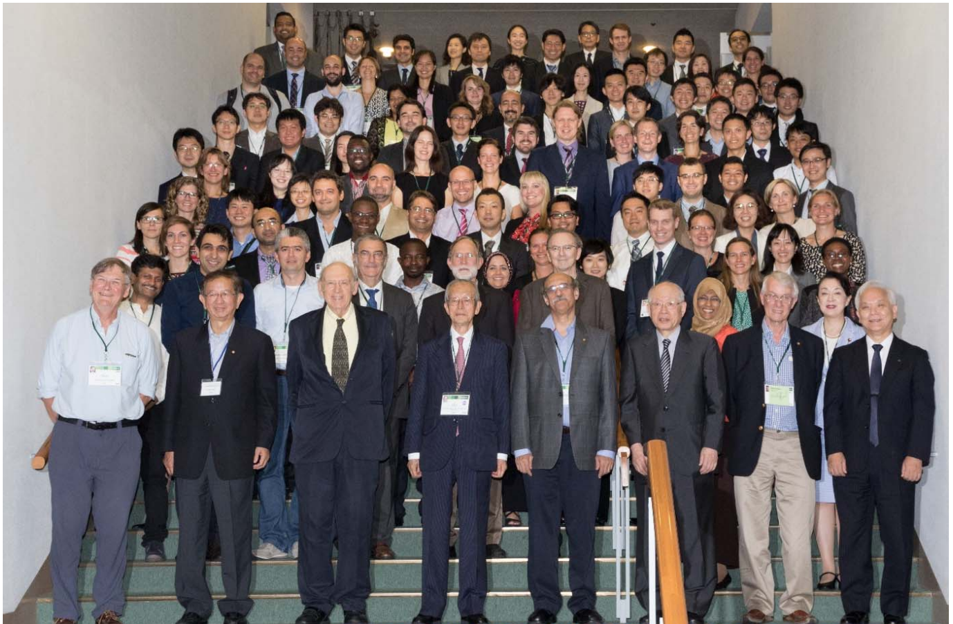
9 Nobel Laureates joined "Dialogue between Future Leaders and Nobel Laureates"