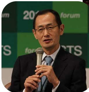
Prof. Shinya Yamanaka of Kyoto University, Japan (Nobel Laureate 2012)