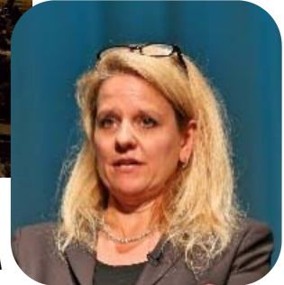
Dinner Speaker: President Gwynne Shotwell of Space X, USA