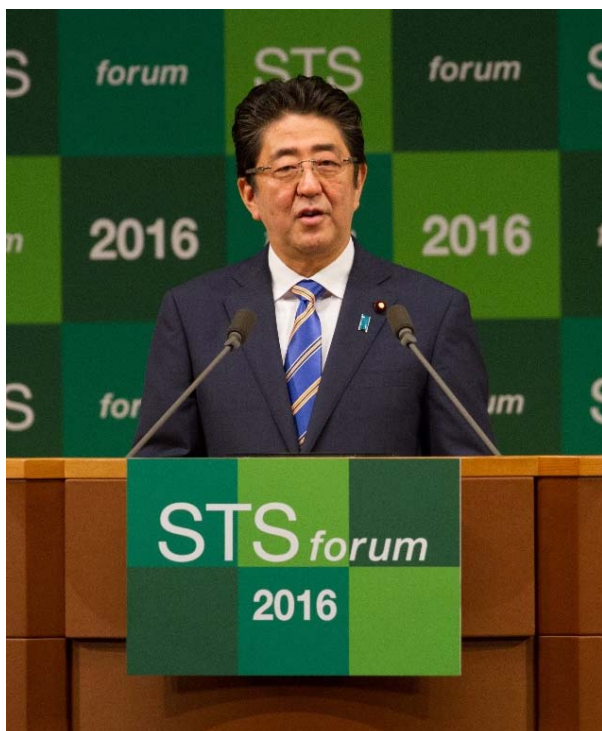
Prime Minister Shinzo Abe giving a keynote speech at the Opening Plenary Session..