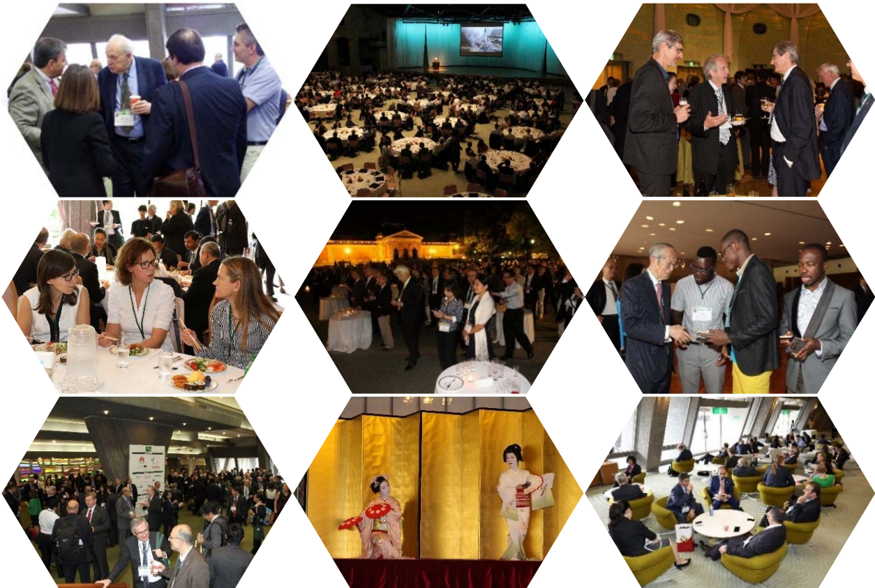
Participants enjoy the interaction with the leaders from the diversified backgrounds.

The objective of the STS forum is to provide a platform where the world leaders in the field of policy making, academia and industry gather and discuss how to deal with S&T issues for the future of the mankind and thus the networking among the participants becomes crucial. During the 13 th Annual Meeting, STS forum provided the plentiful time and opportunities for the networking time like coffee break and lunches in addition to the Official Dinner on the First Day and Special Buffet Dinner at Kyoto National Museum on the Second Day which was organized with the collaboration of Kyoto Prefecture and the Kyoto City.