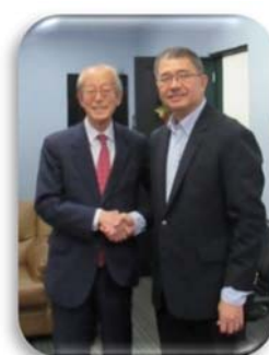
Minister T. de la Pena of Department of Science & Technology, Philippines