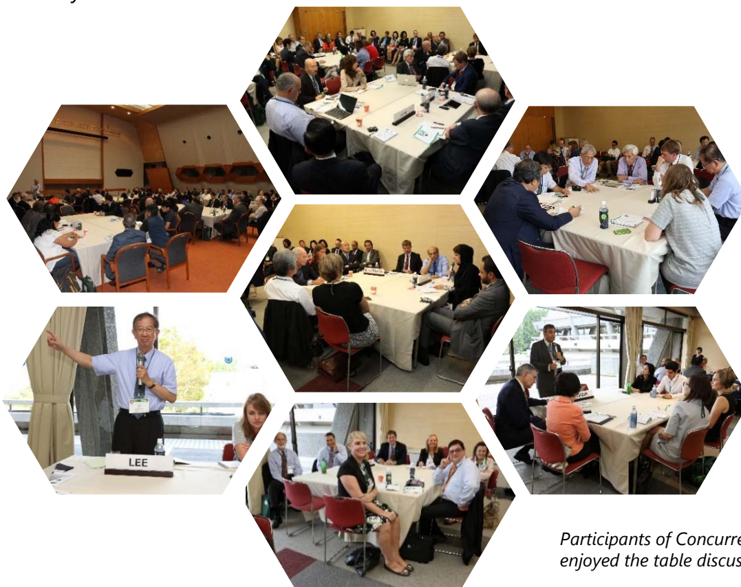
Participants of Concurrent Sessions enjoyed the table discussions.

"Genome Engineering", "Bridging Science and Technology with Society and Politics" and "New Manufacturing Technologies" attracted especially a large audience among the concurrent sessions. "Genome Engineering" discussed about educating the public about the scientific facts related to GMOs (genetically modified organism) and their applications, how we could engage with the emotional issues that cause distress in the general public, and if there were new technologies for genetic modification that would need new approaches to regulations, etc. "Bridging Science and Technology with Society and Politics" emphasized that the open and informed communication among the different actors was vital to deliver the science-related economic growth. "New Manufacturing Technologies" discussed that the development of sustainable next generation manufacturing processes was critical both in natural resource, energy and environment aspects. Since data-driven IT based manufacturing required use of data centers that consume huge amount of electronic power, manufacturing sector must respond by developing highly energy efficient processes with minimizing waste energy and material use, and also maximizing recovery and recyclability.