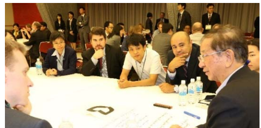
Future Leaders discussing with: from Left, Sir R. Roberts, Physiology of Medicine 1993, Prof. J. I. Friedman, Physics 1990, and Prof. Y. T. Lee, Chemistry 1986.