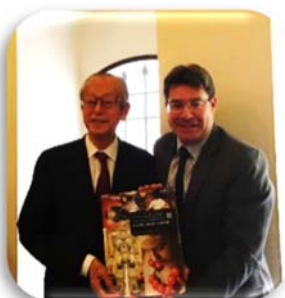
Minister Ofir Akunis of the Ministry of Science, Technology & Space, Israel.