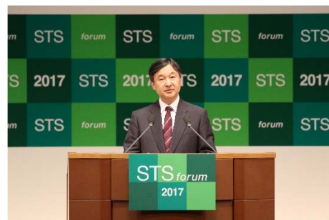
His Imperial Highness the Crown Prince delivered a speech at the Closing Plenary Session.

On the last day of the 14 th Annual Meeting, we received the honor of the presence of Their Imperial Highnesses the Crown Prince and Crown Princess of Japan at Plenary Session 300 “Key Messages from Concurrent Sessions” and Closing Plenary Session. His Imperial Highness the Crown Prince delivered a speech at the Closing Plenary Session.