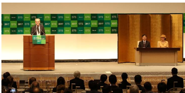
Their Imperial Highnesses the Crown Prince and Crown Princess listen to the speech by Professor Torsten Nils Wiesel, President Emeritus of the Rockefeller University (Nobel Laureate Physiology or Medicine 1981).

For the side events, CEO Lunch Meeting was newly added where 18 CEOs from the world attended. “Dialogue between Future Leaders and Nobel Laureates” where approximately 140 future leaders enjoyed the stimulating discussions with 15 Nobel Laureates. 1,400 participants included the world leaders from the field of academia, research, industries and governments.