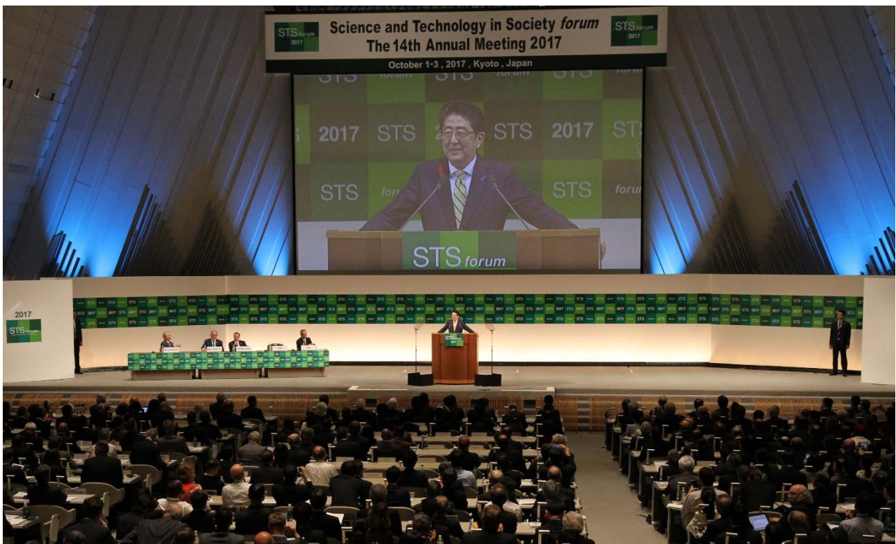
Prime Minister Shinzo Abe of Japan making a speech at the Opening Plenary Session.

With a total of approximately 1,400 participants from about 80 countries and regions, the 14 th Annual Meeting of STS forum , Science and Technology in Society forum , was held at the Kyoto International Conference Center (ICC Kyoto) Japan on October 1-3. This year, total of 40 sessions (10 plenary and 30 concurrent sessions) and 11 side events were held with lively and far-reaching discussions over the pressing themes. Some of the sessions included Sustainable Development, Science, Technology and Education in Digitalized Society, Artificial Intelligence, Environment and Health and Innovation in Society.