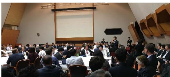
Concurrent Session “Artificial Intelligence (AI)”