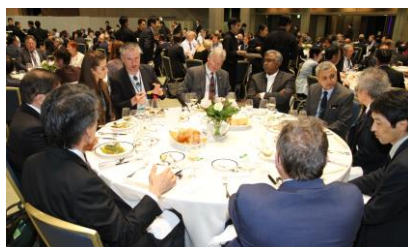
Official Dinner on Oct. 6