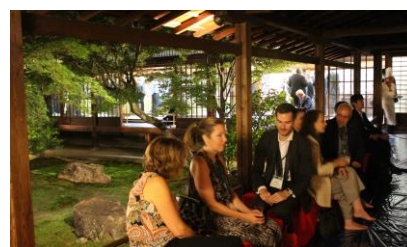
Dinner at Kenninji Temple on Oct. 7