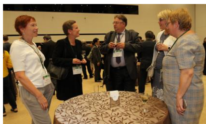
Networking Plaza on Oct. 5