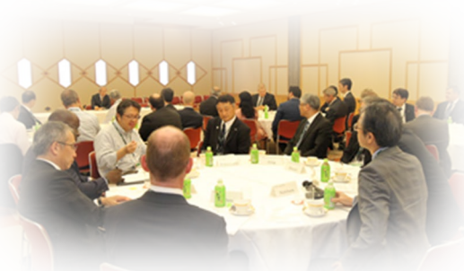
CTO Meeting held during STS forum 2019 - 16 th Annual Meeting

We are planning to organize or co-organize online most of the peer meetings which have been taking place so far in our usual face-to-face annual meetings. Those participants who represent their organization will receive an invitation to respective peer meetings.