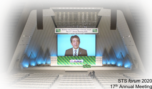
STS forum 2020 17 th Annual Meeting